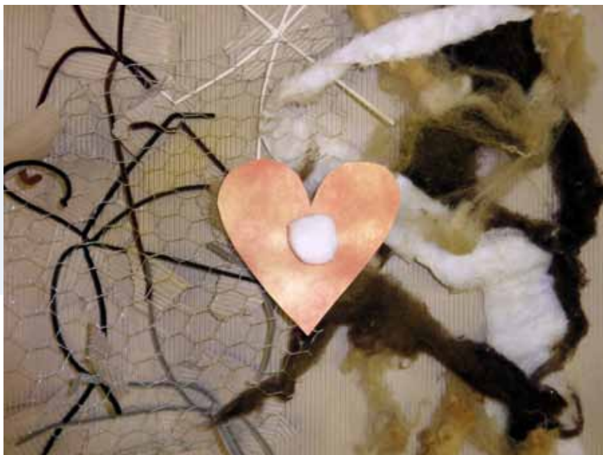
Image 2: '... the two emotions are integrated in such a way that they exist beside each other and that they can become unified ... by working with contrast and material such as chicken wire and sheep wool, symbolising contrasting emotions ... together in one work of art. ... Both are possible; at the same time, it was such an eye-opener for me ... as if things have come together. Before, I was such a mess; my feelings were rushing through each other. ... I got more of a grip on myself.' (Respondent 2, a 44-year-old female)

patients differentiate between emotions, thoughts, patterns and inner conflicts or contradictory feelings. Personal integration and more self-coherence were facilitated by bringing conflicting emotions, thoughts and behaviours into one coherent image. The following quote illustrates this integration process (Image 2).