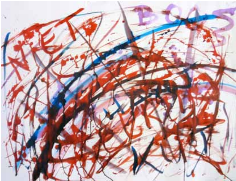
Image 3: ‘And I’m thinking, “oh well, I will see what comes”, and I was splashing around with some ink, and the red was like blood for me, and everything was boiling inside, I just got really cross, I felt really anxious and I had to distance myself, it was so important to me, because I usually push away the anger inside of me ...; it became clear to me how angry I actually am, that is something I really had to face here. ... My husband said: “You will get through the rest, but this had to be brought up”. For me, it was a real turning point. I also realised that by being in contact with the group about this, a lot of emotion could break loose. ... at that moment I realised that I do have control of it.’ (Respondent 9, a 54-year-old female)