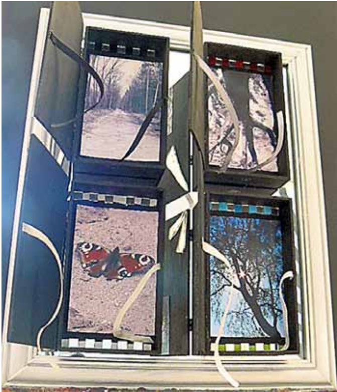
Image 4: ‘AT has really helped me to work on things or to get things going. This project was actually a starting point of me facing a lot deeper problem that I had been avoiding in verbal therapy until then ... about the (um...) sexual abuse in my past. ... I made photos of symbols that stand for me and for a part of my life. ... I put them in cigar boxes, they each represent a certain moment in my life ... and I wrote a poem to go with each part.’ (Respondent 18, a 27-year-old female)