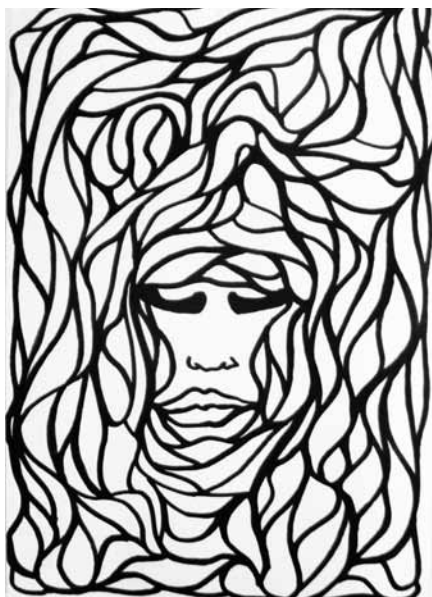
Image 1: 'I am scared stiff every time I see what I draw. I do tend to play down things ... I look at it and I often get a bit of shock, because how trapped or how unsafe I felt comes to the surface.... Really intense emotions are revealed. ... Through becoming conscious, feelings can be integrated.' (Respondent 27, a 21-year-old female)

'Personal integration' is defined as the ongoing self-definition in which the integration of contradictive polarities in oneself leads to more self-coherence and self-acceptance. The patients mentioned that they could express and portray their personal issues, emotional experiences and identity or self-image in AT. They felt that their identities became visible, which led to an ongoing self-definition in which identity and self-image could be strengthened and become more positive. The patients noticed that another characteristic of AT is that the artwork confirms what is already there and that their development in the therapy process became visible in the work of art. They spoke of how a more coherent, more stable self-image and more self-acceptance arose. By expressing emotions through their artwork, they could further investigate and unravel their thoughts, patterns and inner conflicts. The following quote emphasises how art work can